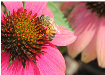
Honey bee on purple coneflower.

Important pollinators, such as honey bees, bumble bees and monarch butterflies, have gained attention in recent years due to concerns about declining populations. This Quick Guide describes steps gardeners and others can take to help protect pollinators.