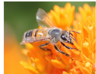
Honey bee on butterfly weed.

Key animal pollinators in Ohio include honey bees, native bees, flies, butterflies, moths and other insects, as well as hummingbirds. Pollinators are vital to the production of many food crops and provide a service essential to the survival of many native plants. Bees are considered the most important pollinators because they are uniquely adapted to gather and transport pollen. Ohio is home to about 500 species of bees.