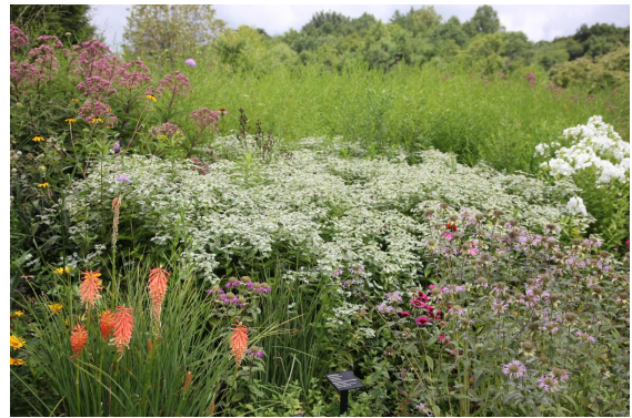
Native mountain mint (center) is a favorite nectar source of many pollinators.